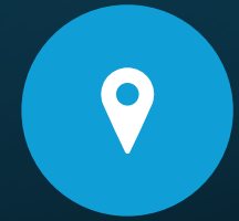
Drug and Alcohol Recovery Services by Local Authority